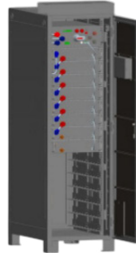
Rack TP80(S) TP80(S)-with LCD TP80-without LCD